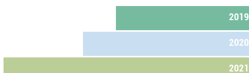
Illustration of increase in crisis contacts per year.

In FY21, the crisis center responded to 57,543 calls; 4,143 texts and chats; and 6,269 follow-up calls to clients.