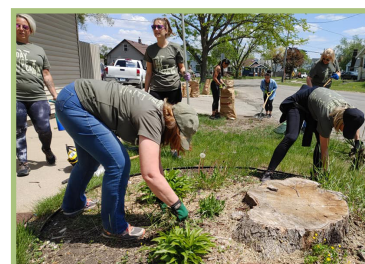
Volunteers clean up around a tree lost after the derecho during Day of Caring.

Thanks to volunteers year-round, we are able to complete special projects that support our staff and mission.