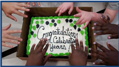
Youth celebrate the 50th anniversary of Foundation 2 with a cake at the Emergency Youth Shelter.

Foundation 2 celebrated its 50th anniversary of services. We were started in 1970 by a group of Kennedy High School and Coe College students. We celebrated the anniversary with a City of Cedar Rapids Mayor's Proclamation, downtown window display, historical photos on social media, postcard, cake, and more.