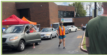
Foundation 2 crisis counselors support residents at a drive-thru resource center in Cedar Rapids following the derecho.

All Foundation 2 buildings in Cedar Rapids sustained some level of damage during the storm. Volunteers helped clean up debris to help us continue to provide quality services with limited interruptions.