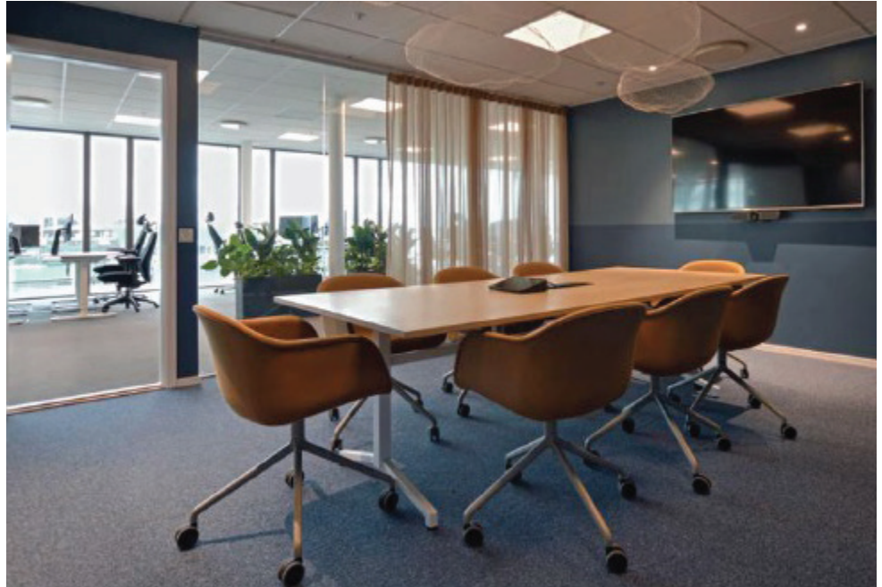
ABOVE: The second and third floors will have a variety of workstations, including flexible options, group workspaces, and office hoteling.

The location is a premiere Downtown spot with significant exposure to local businesses and thousands of Downtown patrons, employees, and residents. We look forward to maximizing our ability to equip our community with mental health knowledge and provide crisis services for all in our new location.